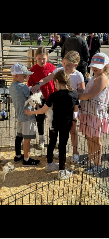
Fun had by all at the PTO Family Ice Cream Social/Kiss the Cow event held on April 25th.